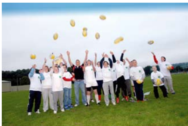
Fig 26: Participants celebrate the completion of the summer Tag Rugby competition in Derry