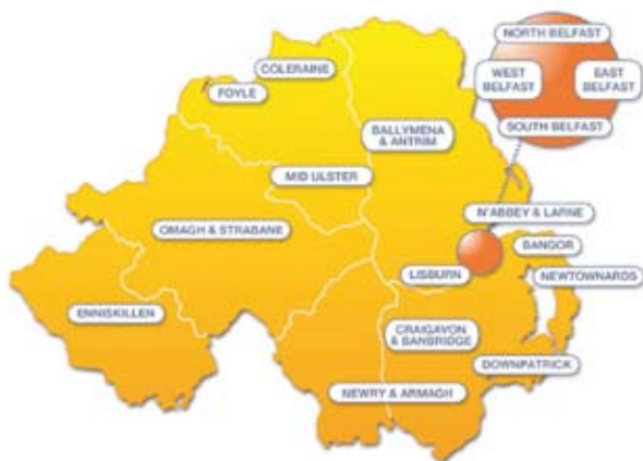
Fig 19: Location map of Community Services teams operating across Northern Ireland

Similarly a change in approach indicated that the project based model of service structure, while allowing identification with location, had inefficiencies which could be addressed by creating bigger teams spanning larger geographical areas. Consequently the Directorate has been restructured from twenty-three projects to seventeen teams, though this has been accomplished without reduction in accessibility through the development of a hub and satellite structure [Fig 19].