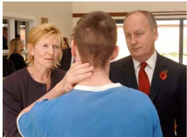
Fig 39: Lady Sylvia Hermon, MP for North Down and Secretary of State Shaun Woodward chat with a young person during their tour of the Centre