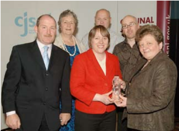
Fig 20: The Inside Out Intensive Bail Support Project, Extern, receive their 'Outstanding Contribution to Working with Young People in the CJSNI' award from (then) Criminal Justice Minister Maria Eagle at the 2007 CJSNI awards ceremony