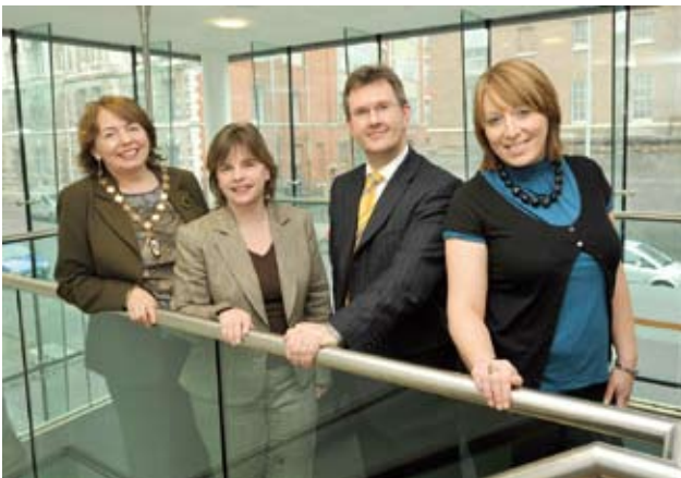
Fig 33: Pictured at the simulated youth conference in support of Criminal Justice Week are: Bernie Kelly, Deputy Lord Mayor of Belfast; Aideen McLaughlin, Youth Conference Service; Jeffrey Donaldson, MP MLA; and Claire Swann, Youth Conference Service

within the youth justice system were treated to an extremely realistic illustration of the conferencing process which powerfully demonstrated the tensions and feelings that exist within the conference setting. The fact that a number of audience members, including Jeffrey Donaldson MP MLA, willingly participated in the conference role-plays certainly added to the occasion.